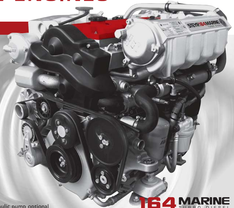
Hydraulic pump optional